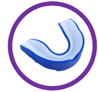
Kids Mouth Guard

Remember: Girls who play sports need to protect their teeth, too! Sports mouthguards aren't just for boys!