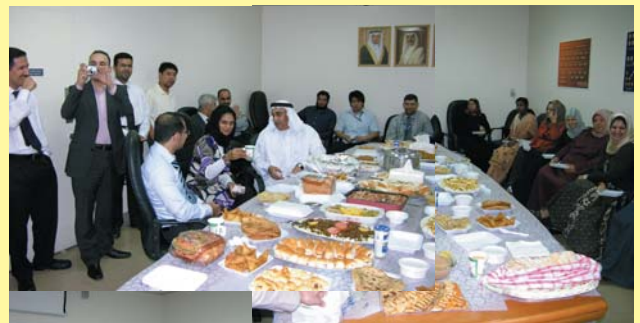
Eid Al Fetir Breakfast