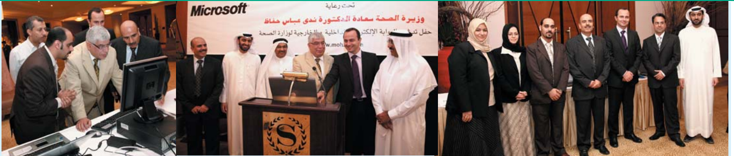
Launching of MoH Intranet Portal