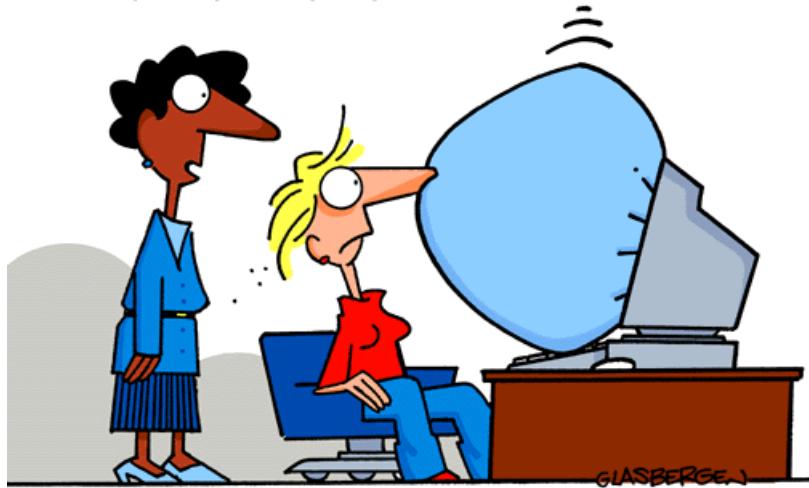
"It's the latest innovation in office safety. When your computer crashes, an air bag is activated so you won't bang your head in frustration."

© 1999 Randy Glasbergen. www.glasbergen.com