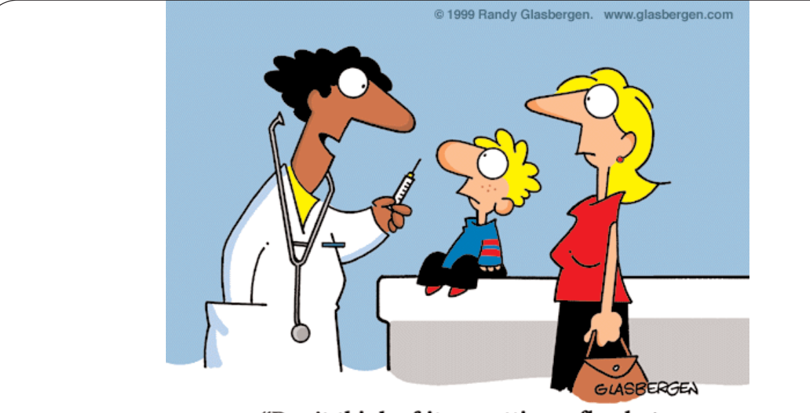
"Don't think of it as getting a flu shot. Think of it as installing virus protection software."